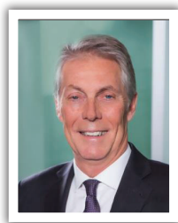
Fred Eisenberger Mayor

A handwritten signature in black ink, appearing to read "Fred Eisenberger".