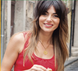
MADE IN ITALY With Silvia Colloca

To All Business Excellence Award Recipients