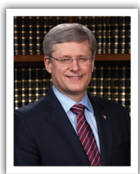
The Rt. Hon. Stephen Harper, P.C., M.P.

Please accept my best wishes for an enjoyable and memorable evening.