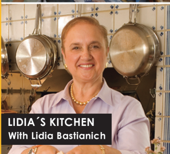
LIDIA'S KITCHEN With Lidia Bastianich