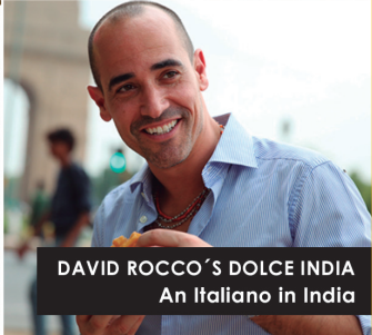
DAVID ROCCO'S DOLCE INDIA An Italiano in India