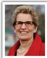
Kathleen Wynne Premier

A handwritten signature in black ink that reads "Kathleen Wynne".